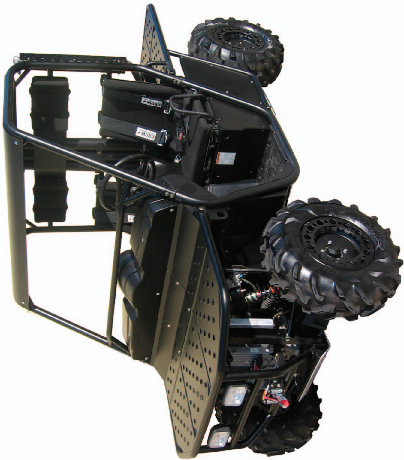
PROWLER II Side-By-Side LTWV (Light Tactical Wheeled Vehicle)